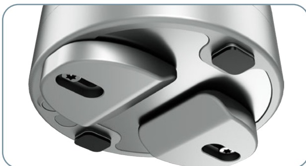
Shown with v-shape nesting tips for cylindrical objects.