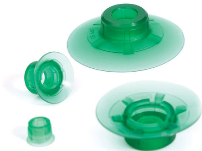
Schmalz SPF Vacuum Cup Properties