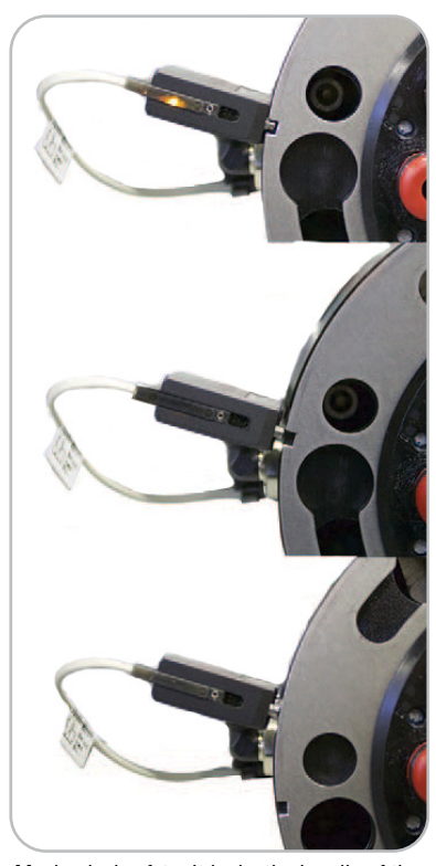
Mechanical safety: It locks the handle of the quick changer, only when correctly engaged.