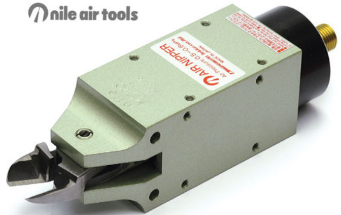
MS Nippers - (Order blades separately)