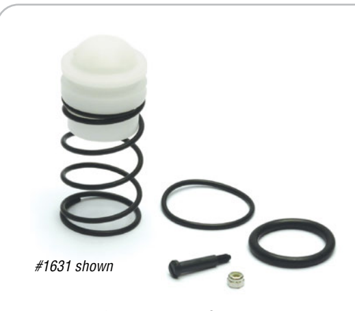
Rebuild Kits for Vessel NR & NS nipper bodies