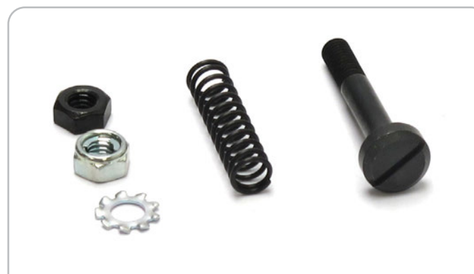
Pin & Spring Kit for NR Nippers