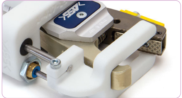
Shown installed on GRZ-20-PS-CS-NPN (Q#3889)