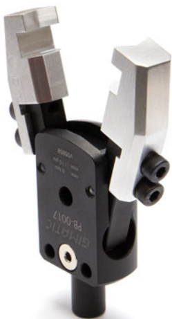
Example Custom Finger