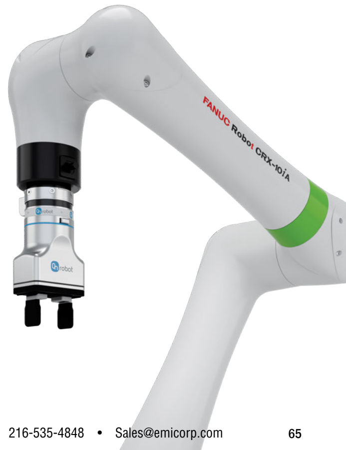
OnRobot HEX Force / Torque Sensor with Gimatic Hot Blade (Q#7286). Degate by teaching your cobot the gate location, force required and part geometry.