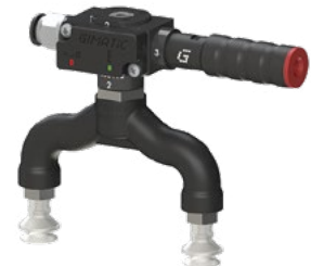
Integration of EJ-MEDIUM cartridges on EOAT in rapid prototyping - Pick-and-Place application