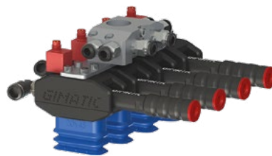
Decentralised EOAT with rapid prototyping