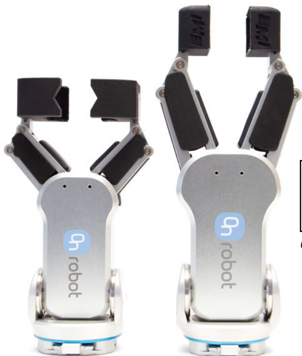
#8201 – RG2