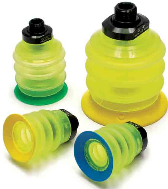
piGRIP Vacuum Cup Lip Properties