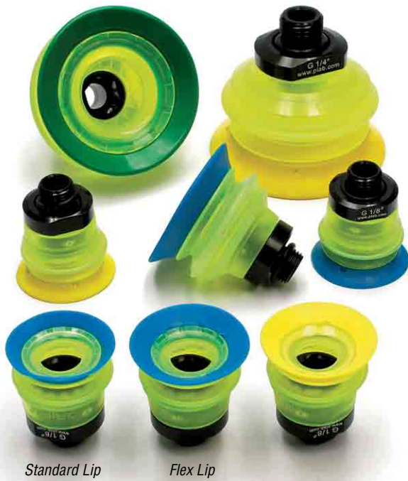
piGRIP Vacuum Cup Lip Properties