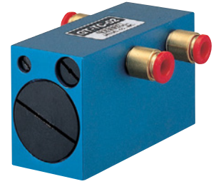
Timing Controller (for sliding nippers)

The timing controller is a three-port solenoid valve having one compressed-air inlet and two outlets. It allows one compressed-air line to first activate the slide mechanism, then activate the blade after a slight delay (or vice-versa). The timing is adjustable between 0.5–1.5 seconds. No electricity is required. Use with exhaust valve on page 911.