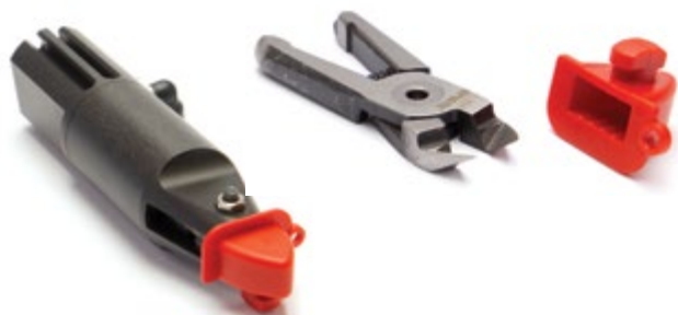
Gimatic Size 5 Blade Covers